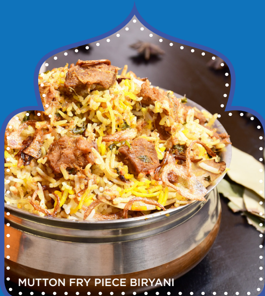
MUTTON FRY PIECE BIRYANI