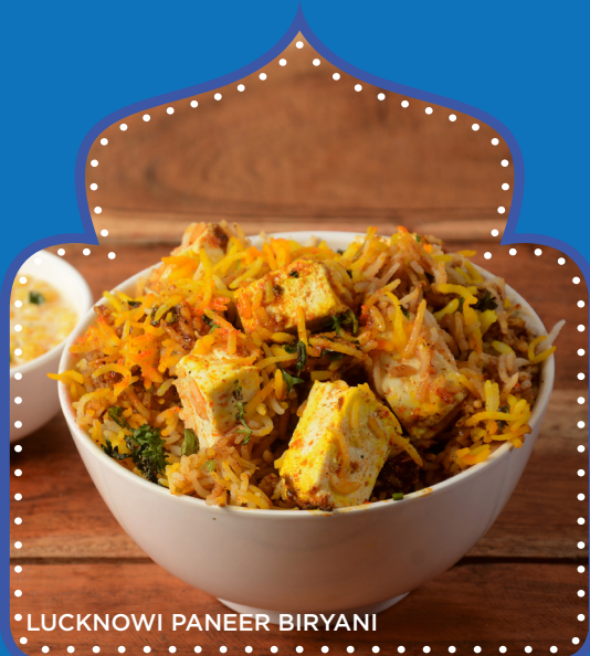
LUCKNOWI PANEER BIRYANI