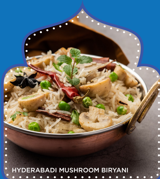
HYDERABADI MUSHROOM BIRYANI